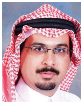
Technical Committee Co-Chair

Technical Services Director (Middle East), Axens