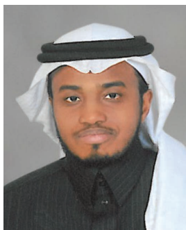
Technical Committee Chairman